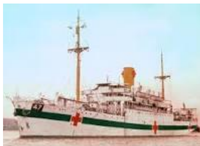
The Hospital Ship Centaur