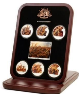
1 st Prize

The sub-Branch is holding a fundraising raffle of two sets of limited-edition Sands of Gallipoli medallions. The raffle will be drawn on 8 th December 2022 at the sub-Branch Christmas function in the Lone Pine Lounge.