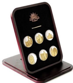
2 nd Prize

First prize is a set of six Lone Pine medallions in a timber finish presentation stand, valued at $225.00. Second prize is a set of six limited edition medallions valued at $195.00. Tickets are $5.00 each and only 500 tickets will be offered for sale. Tickets will be sold by volunteers throughout ANZAC Village, at a pop-up shop in the Gallipoli Building and at sub-Branch meetings.